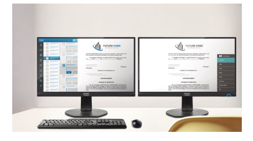
EasyRead mode for a paper-like reading experience